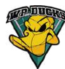
WP Ducks Spain U12 (2)