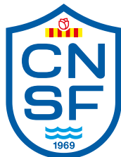
CN Sant Feliu Catalunya, ES 2 teams