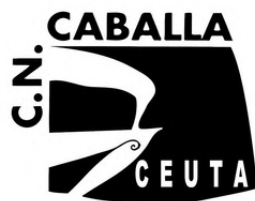
CN Caballa Ceuta, ES 2 teams