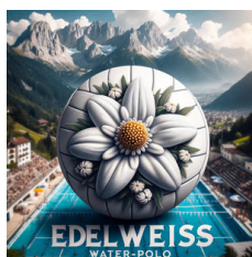
Team Edelweiss France