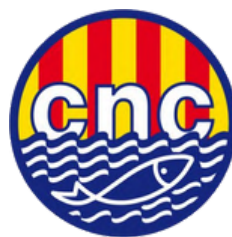
CN Catalunya Catalunya, ES