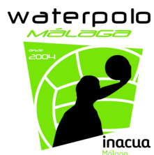
CDW Málaga Andalucía, ES 3 teams