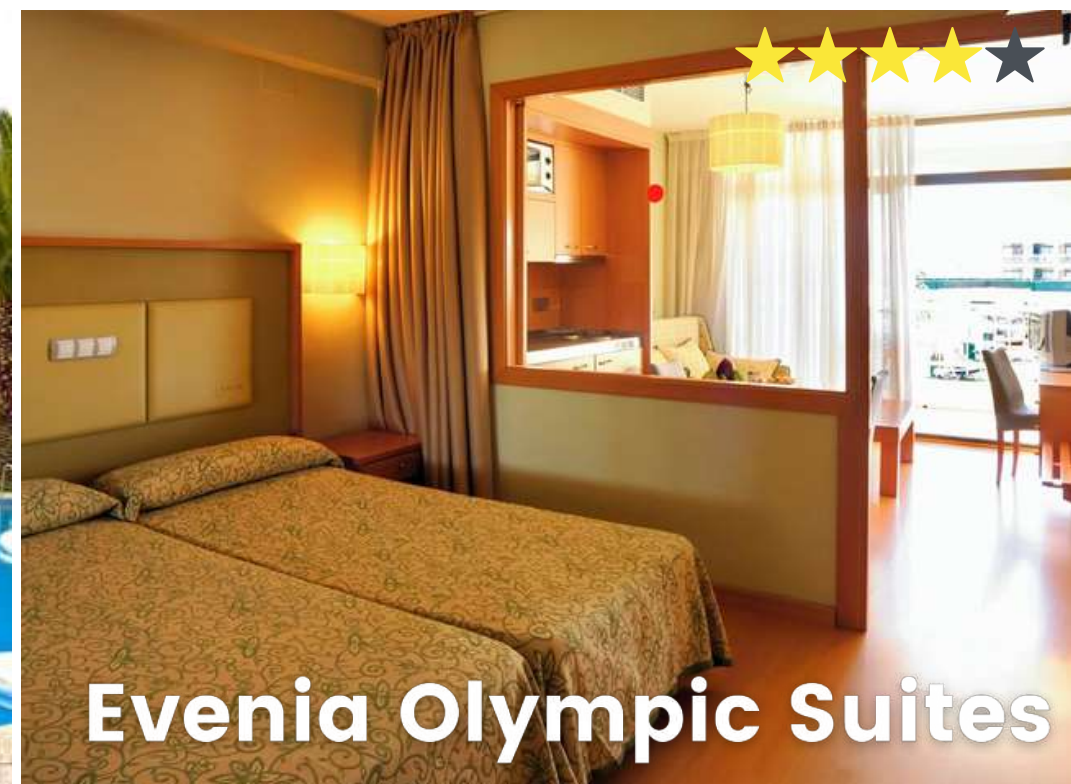
Evenia Olympic Suites